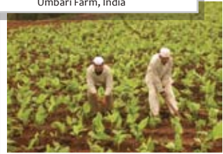
Organic Turmeric Flourishing at Umbari Farm, India