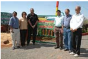
Ethically wild-crafted Shatavari from Umbari Farm, India