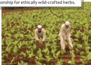
Organic Turmeric Flourishing at Umbari Farm, India