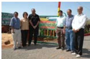
Nisarga Organic Farm & Organix-South relationship for ethically wild-crafted herbs.